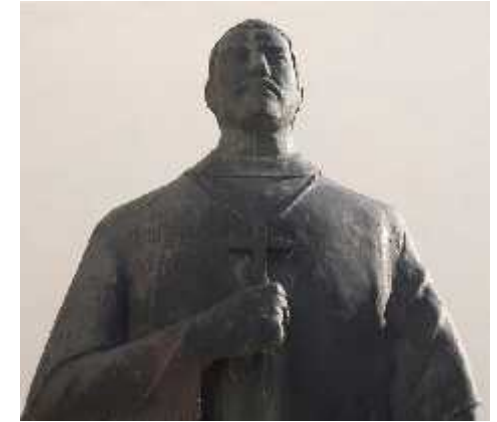
Archbishop Paris Graf von Lodron